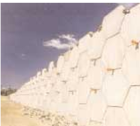
Precast facing panels are available in a variety of panel shapes, sizes and finishes.

V SL Australia introduced the Retained Earth Wall System to the Australian construction market in mid 1990. Since then, three major retaining wall projects have been awarded to VSL with a total surface area in excess of 7000 m 2 .