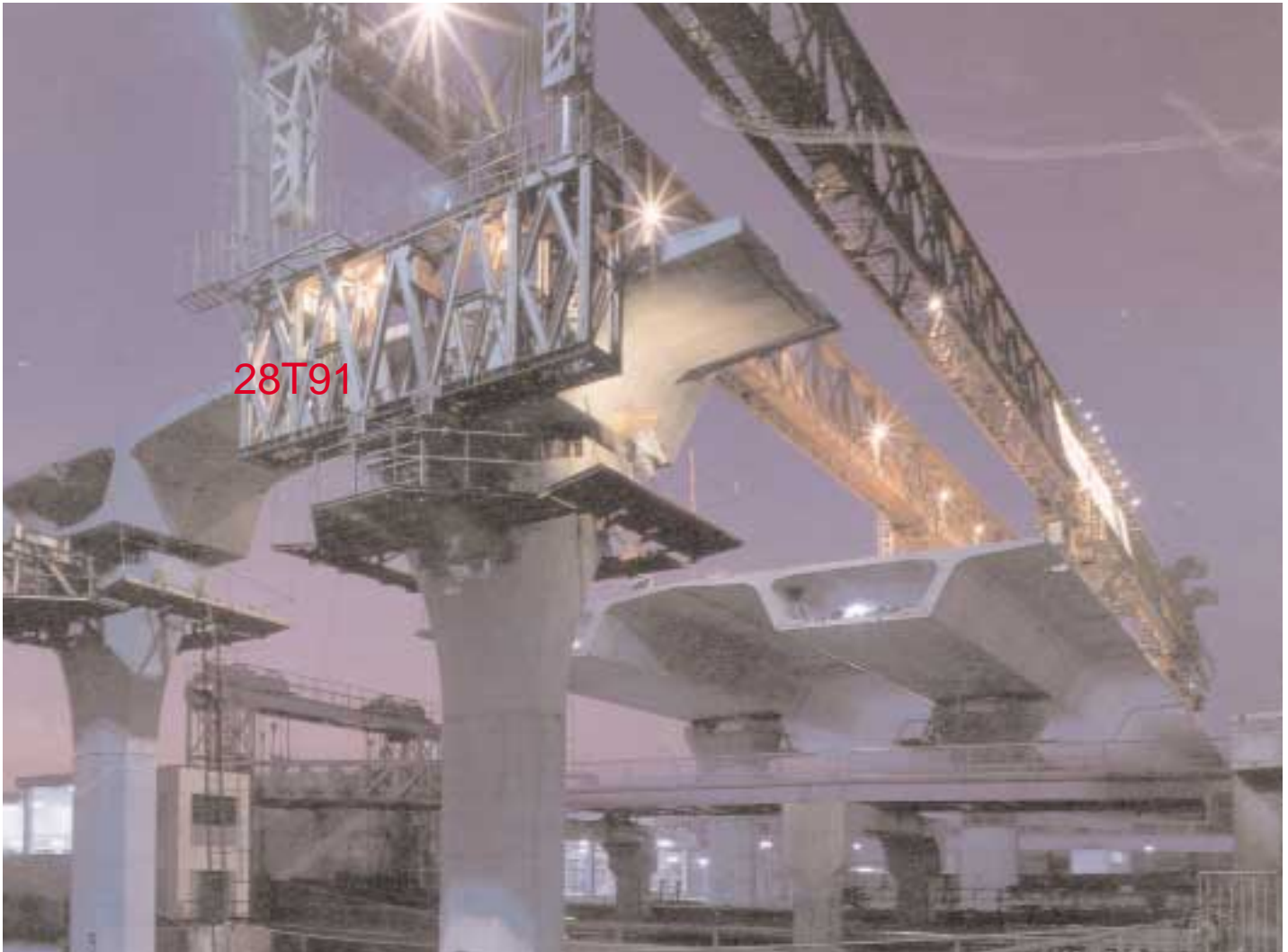
Post-tensioned free cantilever segments provide rapid construction progress.

T he Kwung Tong Bypass links the Eastern Harbour Crossing with the new Tates Cairn Tunnel. The Bypass consists of 3.7 kilometers of twin single cell boxes with spans ranging from 35 m to 48 m. Erection of the superstructure started in December 1989 and was completed in March 1991, one month ahead of schedule.