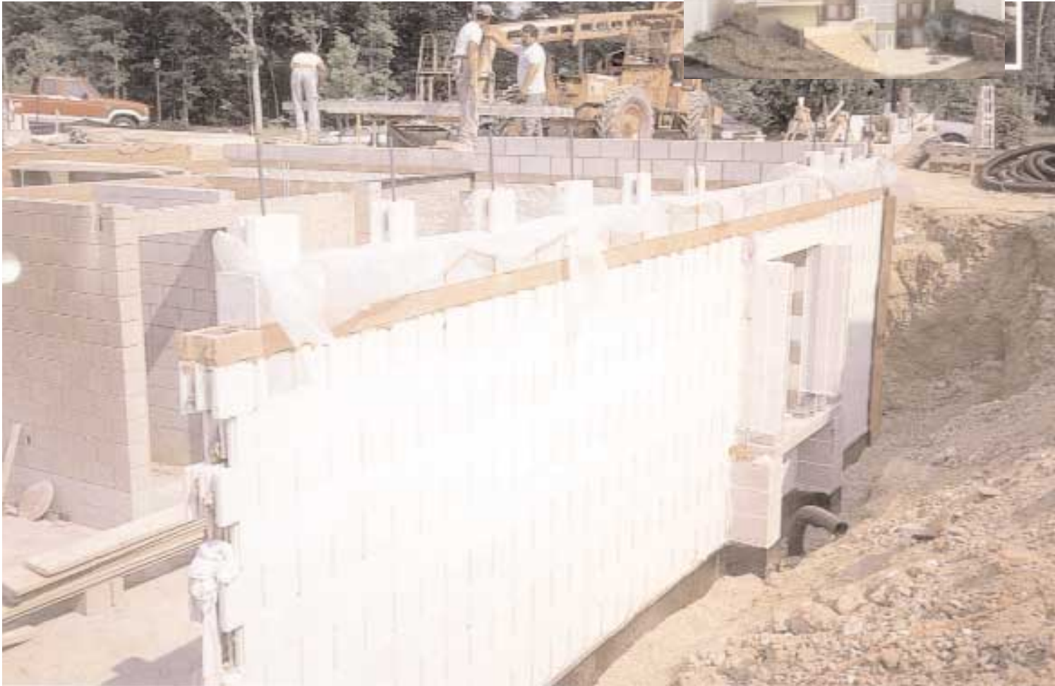
Vertical post-tensioning strengthens masonry walls and furnishes resistance to imposed deformations from lateral earth pressure.