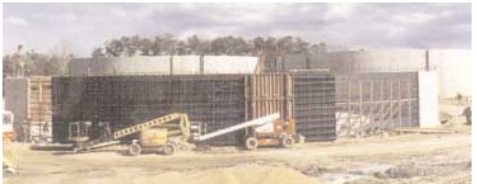
Clarifier tank was designed with corrosion protected CP + monostrand tendons in vertical and horizontal directions.

The VSL post-tensioned solution was chosen in a competition with a conventionally reinforced scheme for reasons of speed and economy. VSL performed as both the post-tensioning material supplier and the engineer of record. D.W. Burt Concrete Construction provided the balance of the concrete package to complete the tanks in place. The tanks were designed with 5 in. slab-on-grade with thickened edges utilizing the VSL CP+ mono-strand tendon. The larger tanks had a height of 30 ft., a 150 ft. diameter, and a wall