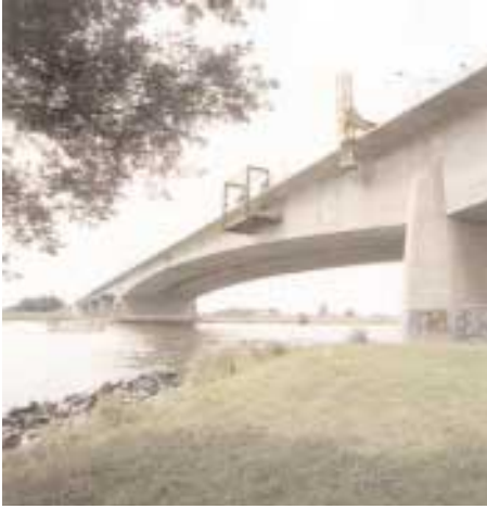
Excessive sagging of main span will be corrected by large-scale repair scheme.

C ivielco B-V, the VSL licensee in Holland, has been commissioned to carry out renovations to the IJsselbrug bridge. Built in 1970 by the free cantilever method the two double box girders with a main span of 150 m are the first and largest bridges in the Netherlands where large-scale pre-stress renovation is being applied.