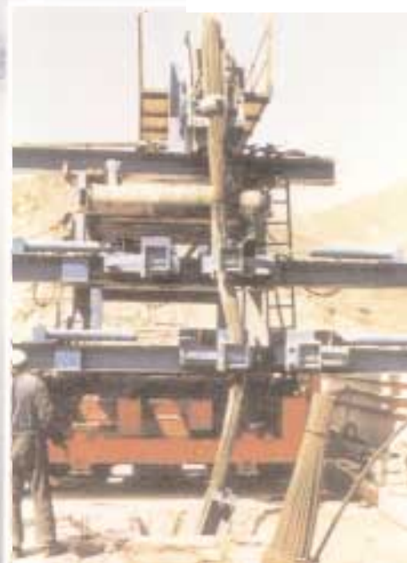
A total of 234 permanent rock anchors tie the cracked upper section of the dam to the stable lower concrete