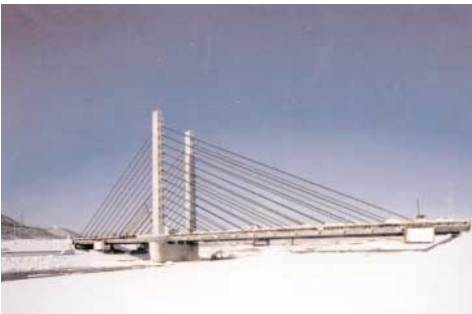
Corrosion-protected VSL Stay Cable System provides reliable performance, long service life and low maintenance.

This project is the first major application of bifurcated stay cables anywhere in the world.