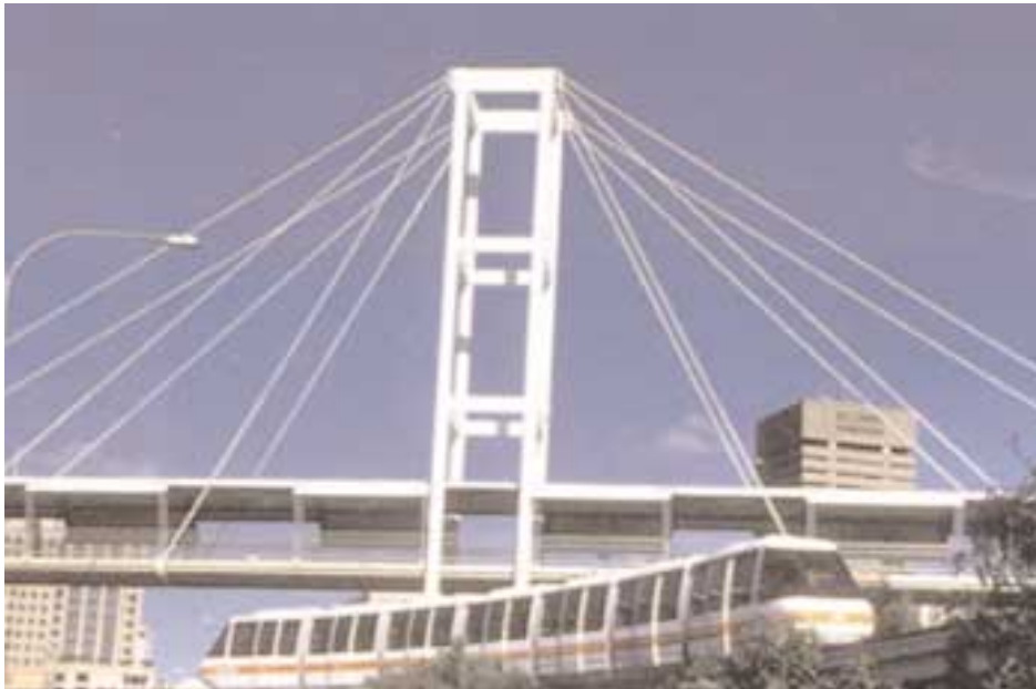
VSL Stressbar-stayed bridges are now in service at University of Western Sydney and the Darling Harbour complex.

T wo new cable stayed bridges recently completed in Sydney both used VSL Stressbars to form the cable stay supports. The use of VSL Stressbars for lightly loaded suspension structures such as these is both economical and practical from the construction point of view.