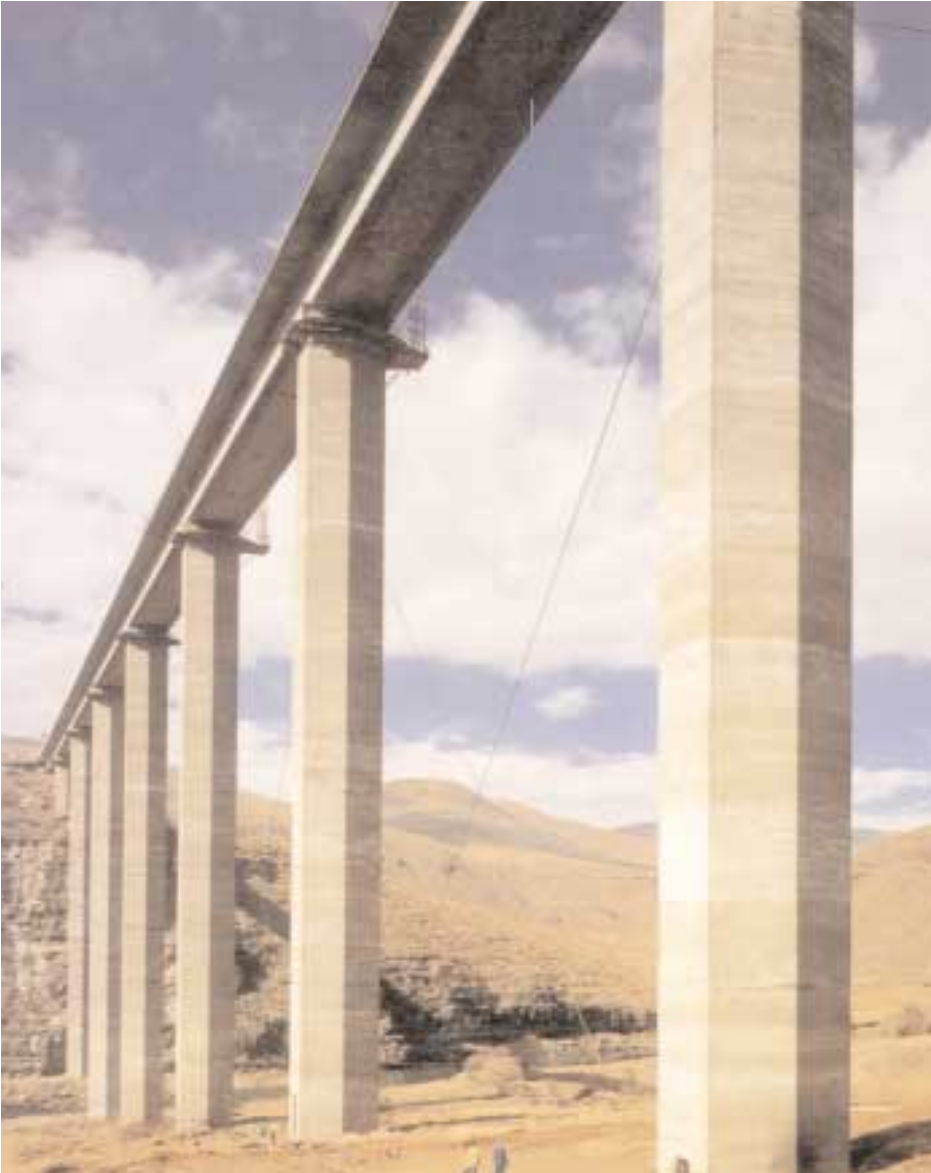
The combination of pier slipforming and incremental launching of the deck proved the most effective construction method