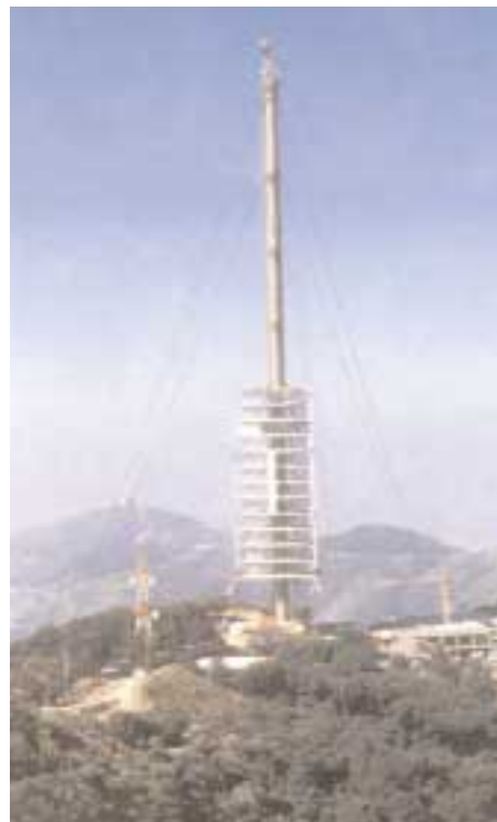
12 storey service building assembled on ground, shown being lifted 85 meters to its final position.

The telecommunication tower on Mount Collserola, a Norman Foster design, is without any doubt one of