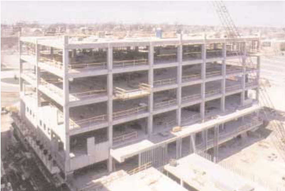
Medical building frame is designed to accommodate two additional floors.

Keith Jacobson VSL Eastern Minneapolis Minnesota