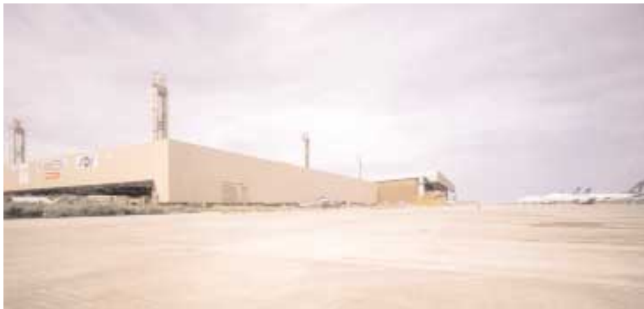
The 3,000 tonnes roof structure was lifted into position with a levelling accuracy during lifting of 2 mm.

G aruda Indonesia, the country's national airline, has had its third hangar roof lifted by VSL in February 1991. The completed steel roof structure along with its mechanical and electrical fixings weigh nearly 3,000 tons and cover an area of 25,725m 2 1210 x 122.5ml. VSL jacks were used in conjunction with an automated electronic sensing device to monitor and control the lifting with an accuracy of 2 mm. The hangar has six concrete piers, which were temporarily braced during lifting.