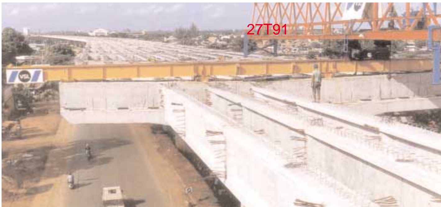
VSL Launching Gantry placed a total of 4,100 I-beams, averaging 200 beams per month.

Johannes Himawan PT VSL Indonesia Jakarta, Indonesia