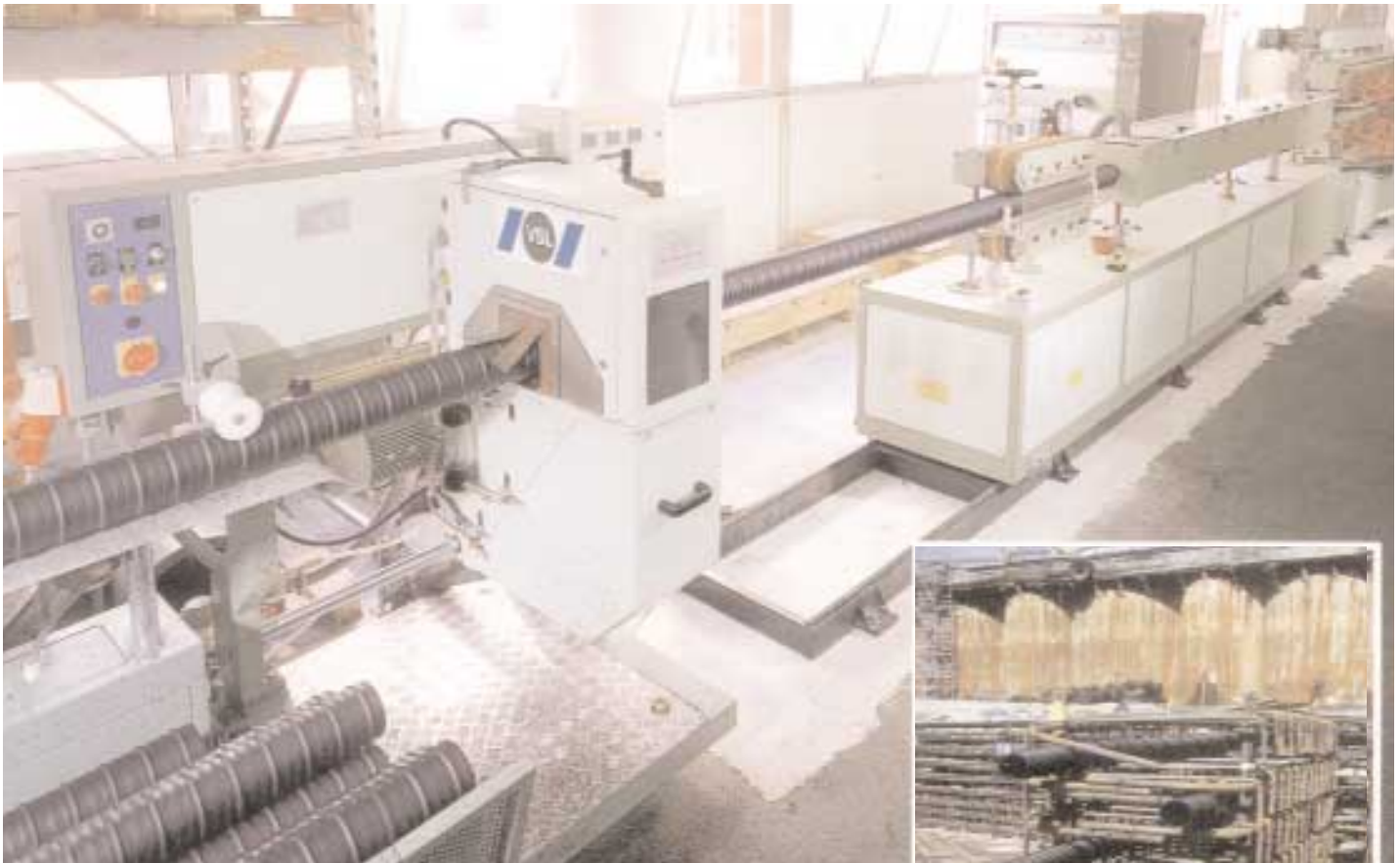
Above: Manufacturing of VSL PT-PLUS Plastic Duct. Right: PT-PLUS Plastic Duct will be installed in the TROLL North Sea offshore platform. TROLL is the tallest Condeep platform ever built.