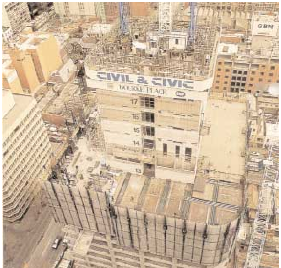
Bourke Place climbform at level 18 with post-tensioned floors at level 13.

P. Tilley VSL Prestressing (Aust.) Pty. Ltd. Noble Park, Victoria