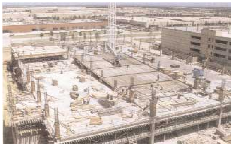
American Airlines parking expansion utilizes more than 460 tons of prestressing strand.

VSL's Dallas, TX office is currently involved in the second phase of construction for the American Airlines parking complex that includes approximately 1,650,000 square feet (153,000m 2 ) of elevated concrete deck. The initial phase of construction was completed by VSL in 1986 and included 700,000 square feet (65,000m 2 ). Construction of the second phase began in April 1989. The structural frame was completed in December 1989. The structural framing system consists of post-tensioned beams spanning 60ft (18.3m) and 7in. (180 mm) post-tensioned slabs spanning 27 ft (8.2m). Post-tensioning is also used for slab temperature reinforcing. ■