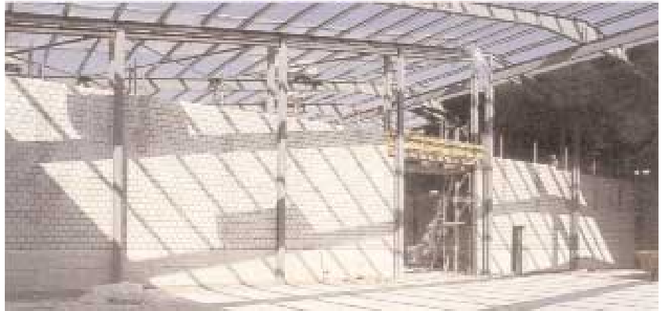
Post-tensioned fireproof factory wall under construction

The monostrand is easy to use in the field. It eliminates the multiple XXX of prestressing bars and provides superior tension capacity per weight of prestressing steel.