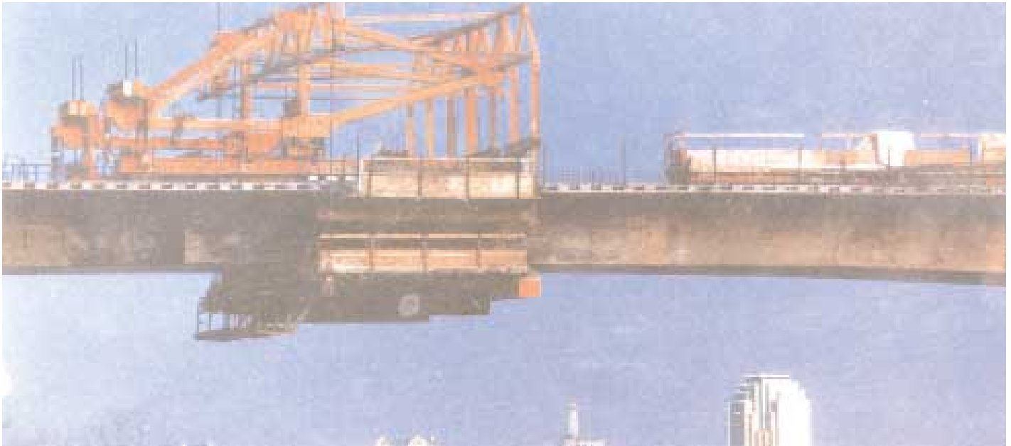
Westmoreland Bridge under construction in Dallas, Texas.

One of the many ways in which VSL has expanded its scope of services for U.S. bridge projects is through the design and supply of travelling formwork systems. When combined with VSL Multistrand post-tensioning, VSL formwork provides bridge contractors with an efficient, single-source structural package.