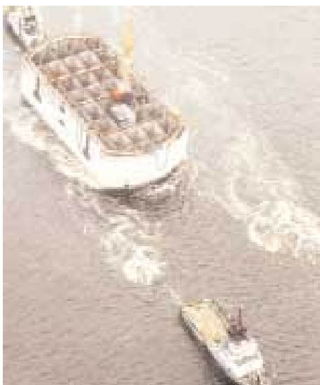
Completed caisson being towed across the North Sea.