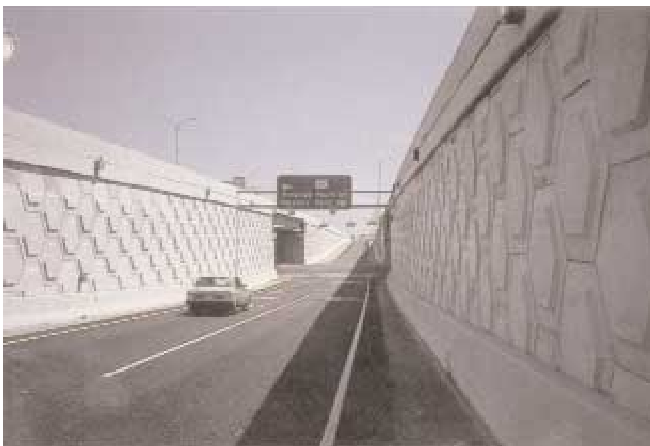
Retained Earth walls provide visually interesting access ramps to 1 - 275 south of Tampa, Florida.

Robert Allen VSL Eastern Lakewood, Colorado