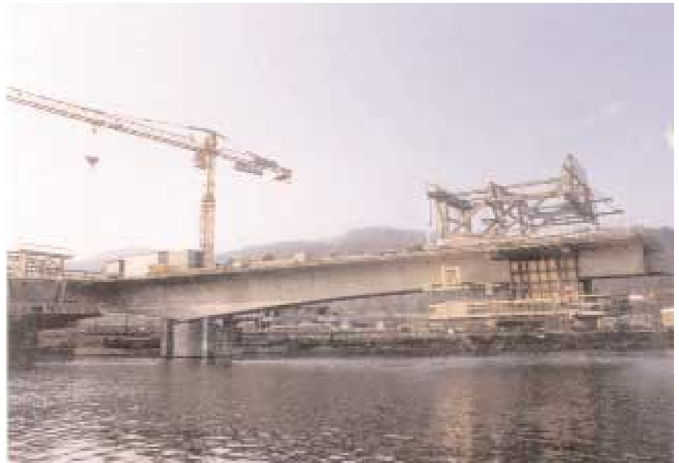
Construction of the twin box girders of the Aare River bridge is well underway.

VSL was the successful bidder for the post-tensioning subcontract. The 19-strand longitudinal tendons are being installed by VSL's push-through method. The transverse tendons with 3 strands are prefabricated and placed directly into the deck.