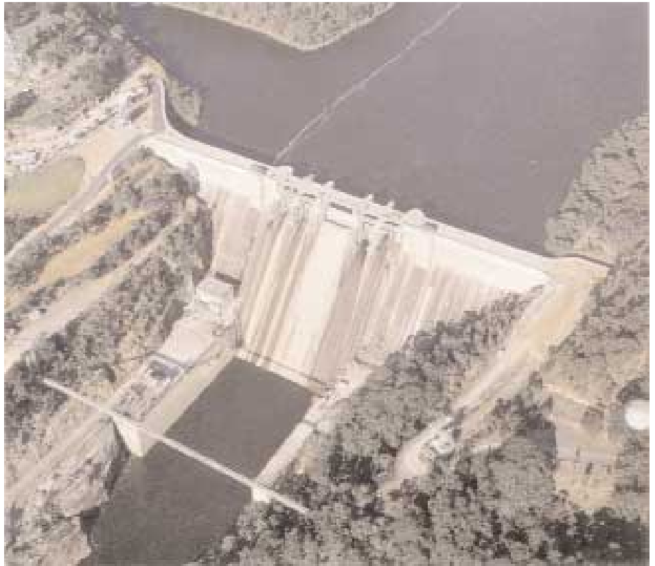
The raised and strengthened Warragamba Dam.