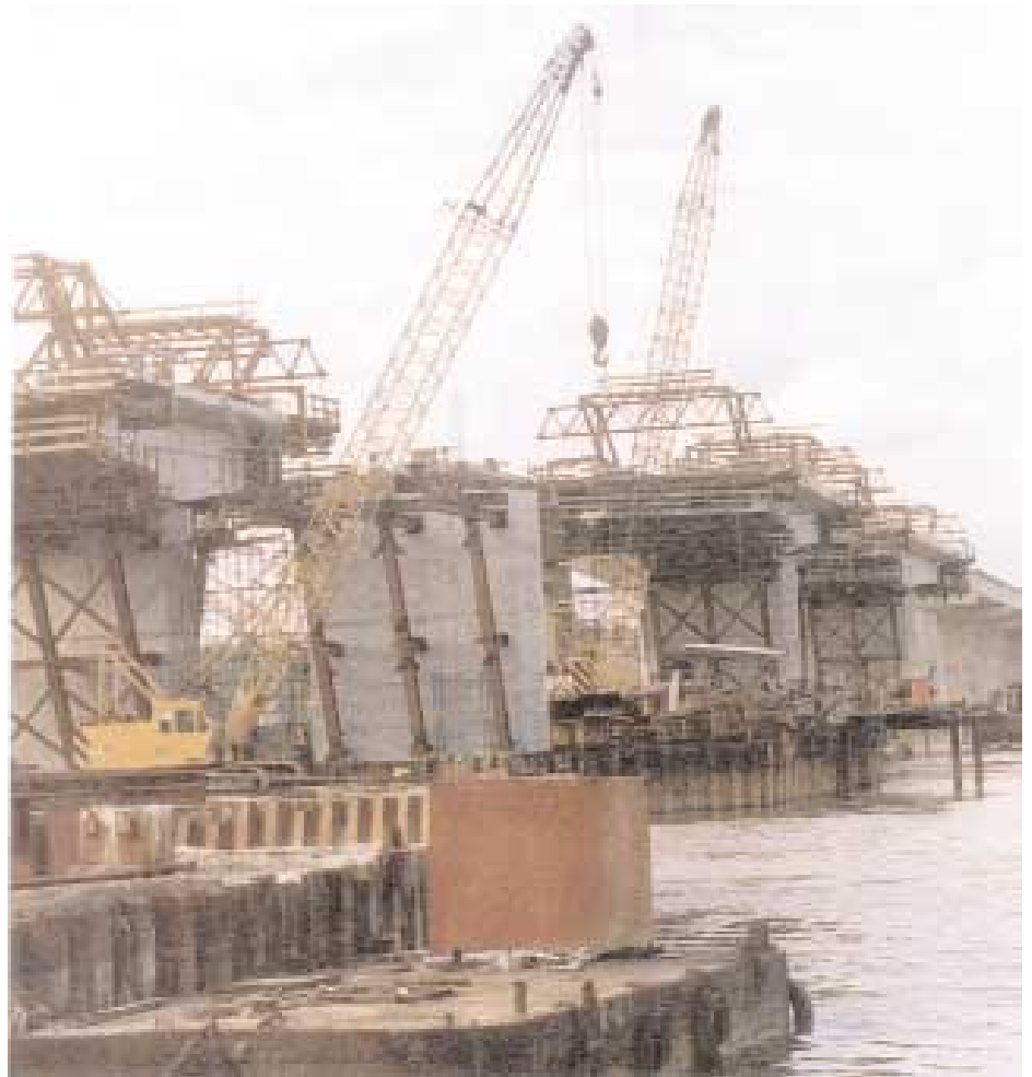
Cantilever segmental construction of the main spans.

Steven Pong VSL Engineers (M) Sdn. Bhd. Kuala Lunopuc Malaysia.