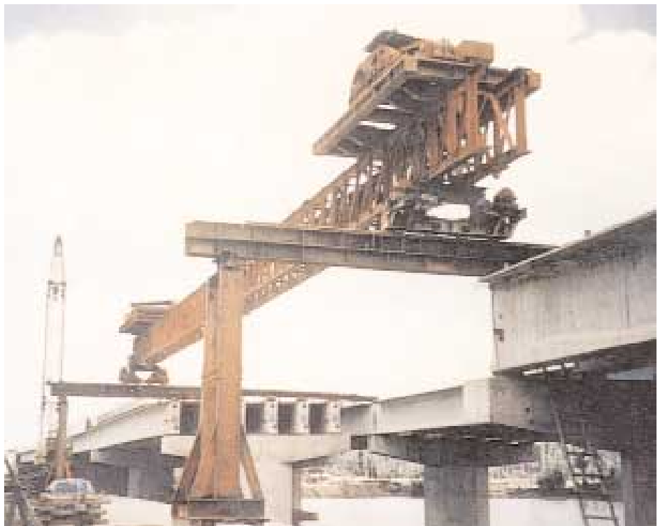
Modified T-beams replace the originally designed I-beams.