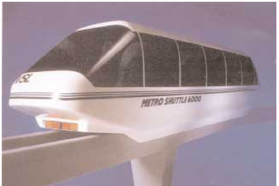
Model of VSL's newly-designed transit vehicle and guideway structure, currently under construction in Nevada.

The Primadonna shuttle is the sixth cable propelled METROSHUTTLE system to be built by VSL Corporation. Previously-built VSL systems are performing reliably in Memphis, Las Vegas (two systems) and Reno (two systems). ■