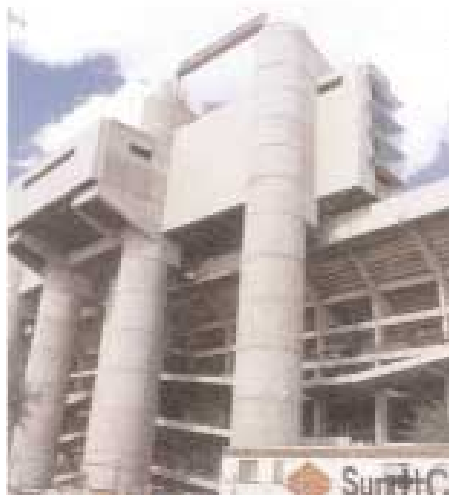
Horizontal and vertical post-tensioning provided the required resistance to bending and overturning forces on the freestanding cantilevered suites.

Travellers at four western U.S. airports now undergoing major expansions will soon be parking their cars in VSL post-tensioned parking structures. VSL Western's Commercial Structures Group has won contracts for Sky Harbor International Airport in Phoenix, AZ, John Wayne Orange County Airport in Southern California, San Jose International Airport in Northern California, and Salt Lake City International Airport in Utah. The contracts include the design, fabrication, delivery and technical assistance for the post-tensioning of over two million square feet (190,000m 2 ) of parking structure deck.