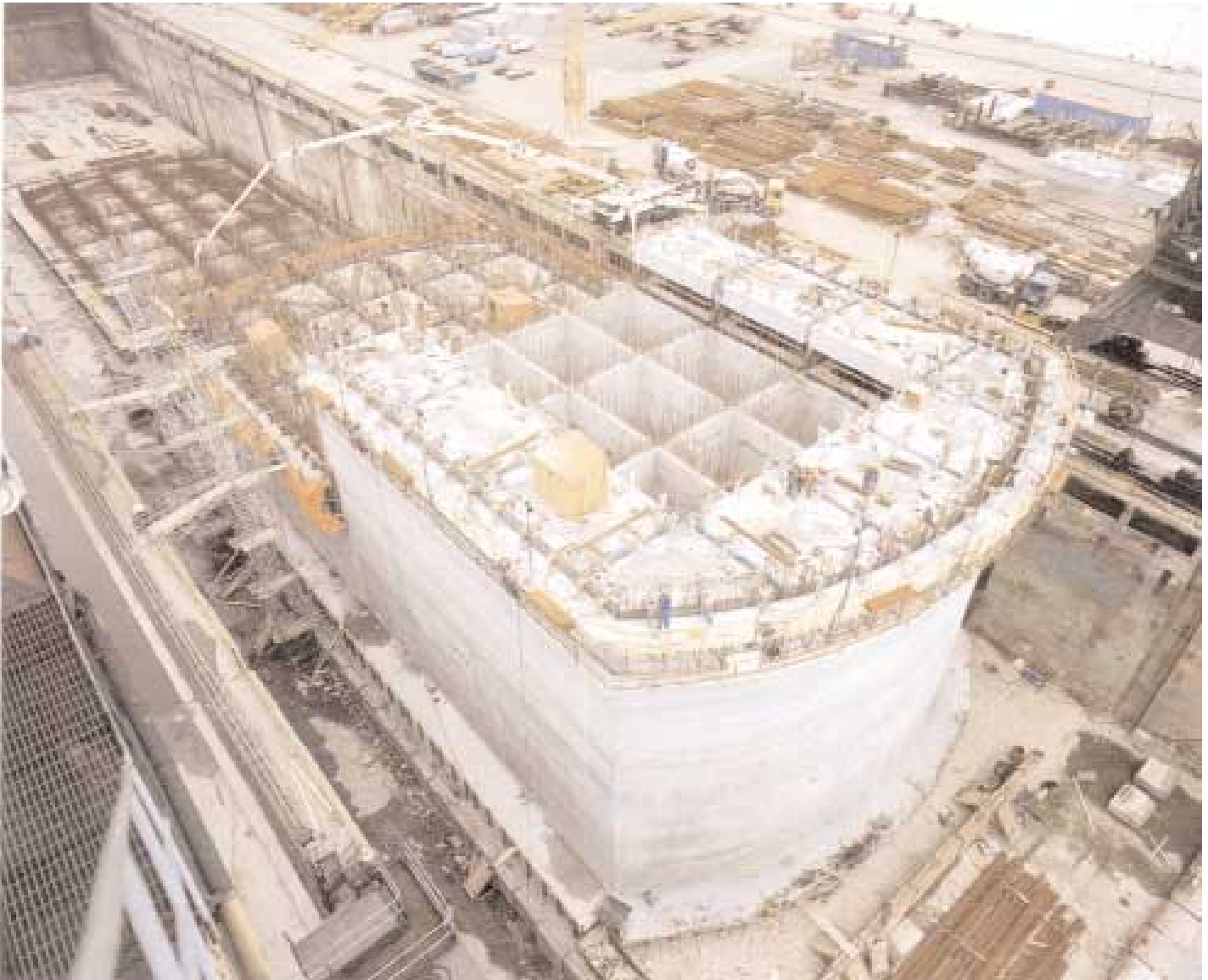
Slipforming of the first Dartford Bridge caisson.