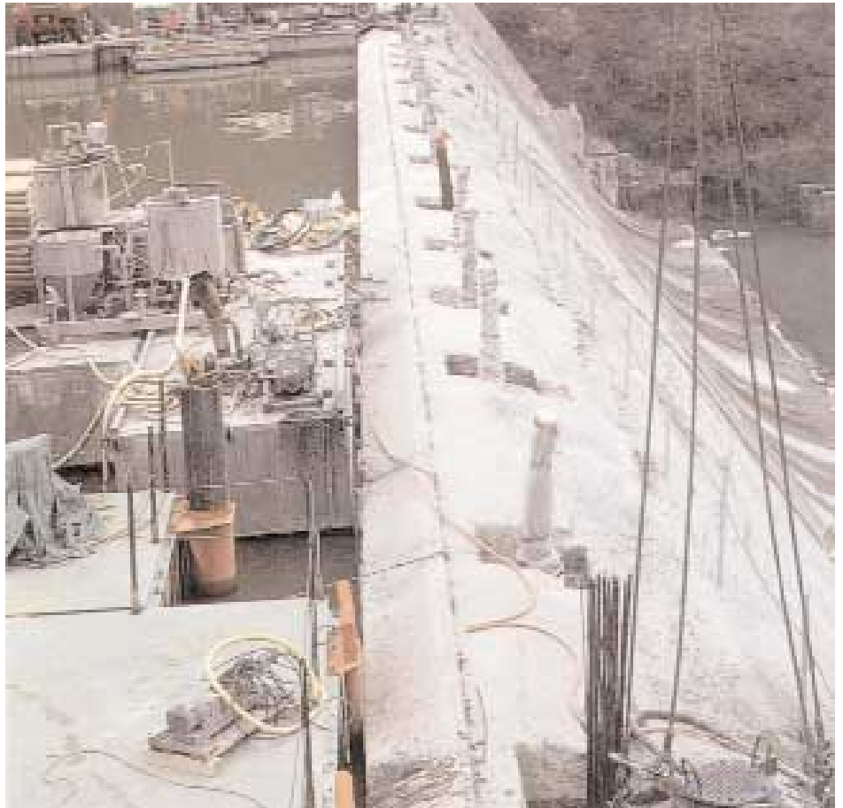
Mountainous terrain required that all of the work be done from barges tied to the upstream face of the dam.

The dam strengthening involved the installation of 52 VSL rock anchors through the crest of the dam. Design bond lengths range from 39ft to 55ft (12 to 17m) with overall anchor lengths of up to 178ft. (54m). The installed anchor capacity totalled 91,416 kips (407,000 kN). VSL designed and supplied all of the rock anchor materials for the project. ■