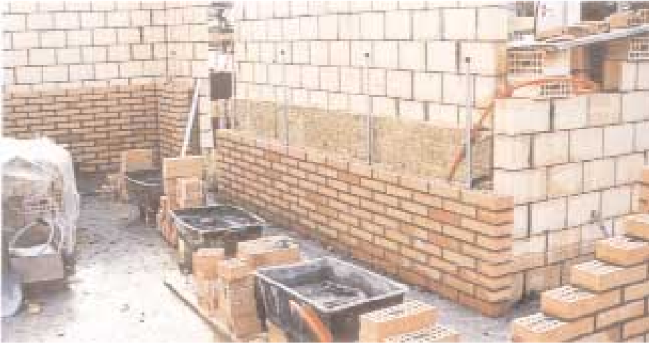
Threading a duct segment