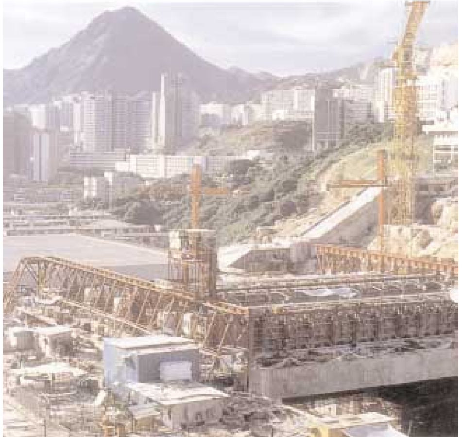
Permanent precasting yard in foreground with beams placed in background.

Formwork for the beams was designed to be moved with the same equipment as used for the beams. The formwork could be moved from bed to bed, lowered onto a completed reinforcement cage and aligned in one day. An extremely fast turn around time for the formwork was achieved. ■