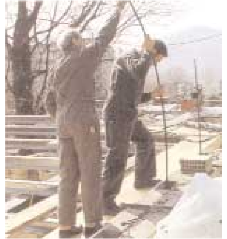
Introduction of monostands