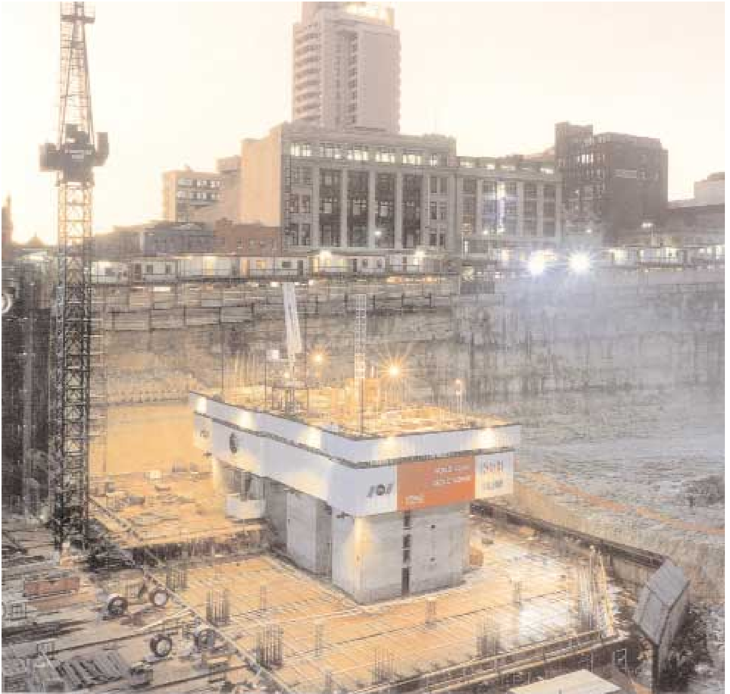
Climbform in place and post-tensioned deck under construction for World Square project, Sydney