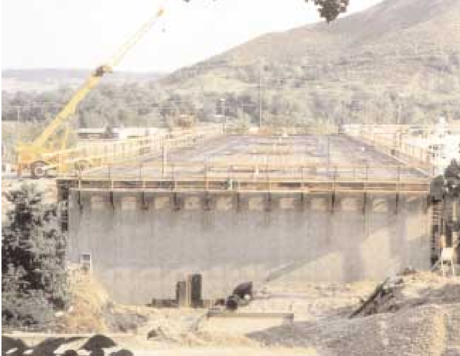
Vertical closure strips at corners allow unrestrained orthogonal movement of walls and base slab eliminating the accumulation of tensile stresses at these critical locations.

oxygen and requires a gas tight structure. Since existing non-prestressed tanks of similar size and shape had not performed as desired, a fully post-tensioned tank was considered to be the most functional alternative. Post-