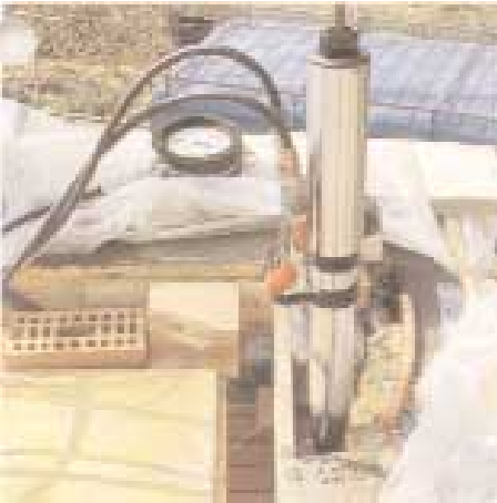
Stressing of tendon