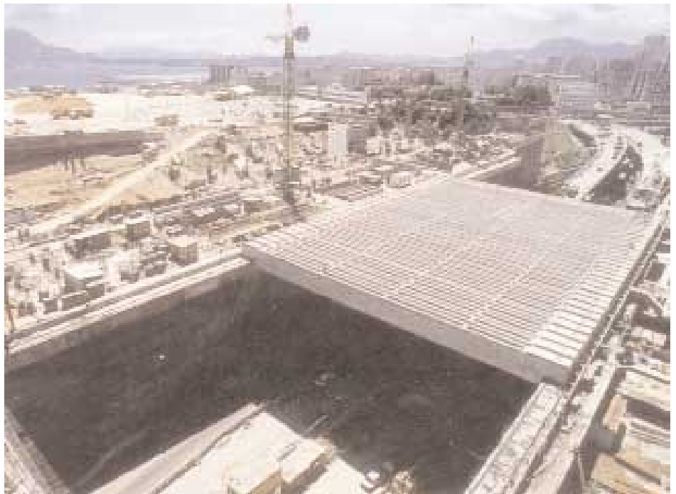
General view of beams which have been moved into position at the end of the structure.