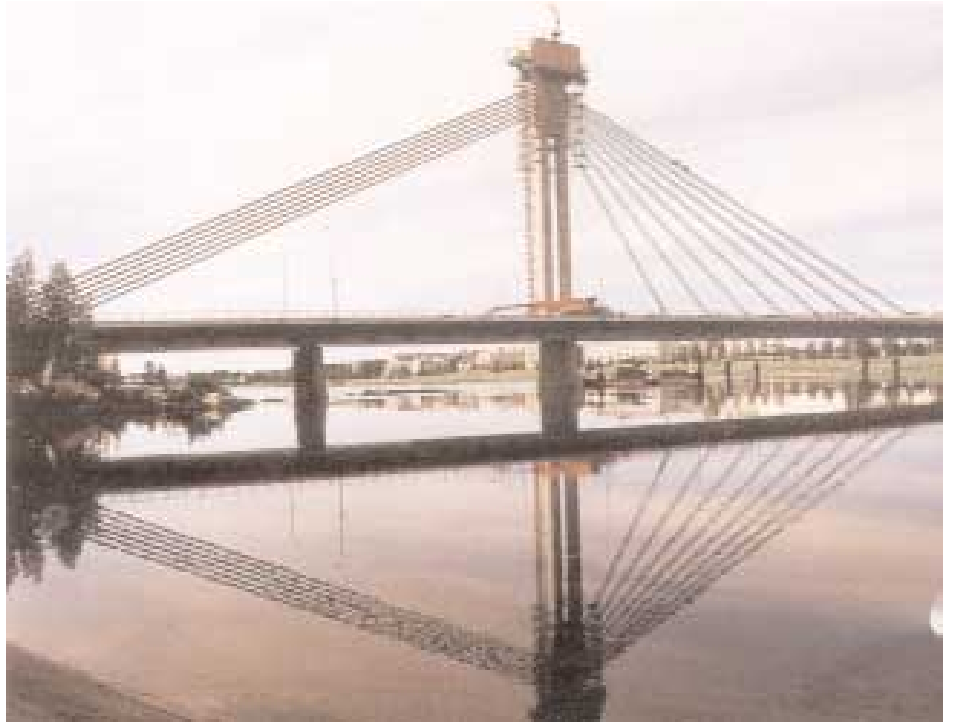
Kemijoki River Bridge nearing completion.

The various stay cable components were assembled on site by VSL and subsequently installed and stressed, using equipment specially designed for the project. After all the cables were stressed and the full dead load of the deck was carried by the stay cable